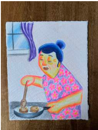
Cooking Ca Kho