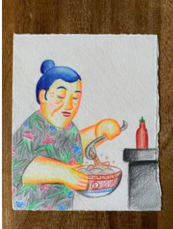
Pho and Siracha