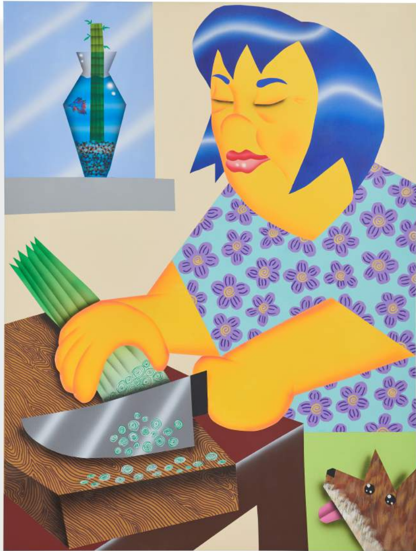
Cutting Up Green Onions