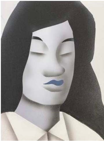
Portrait of a Refugee (Mom F.O.B.)