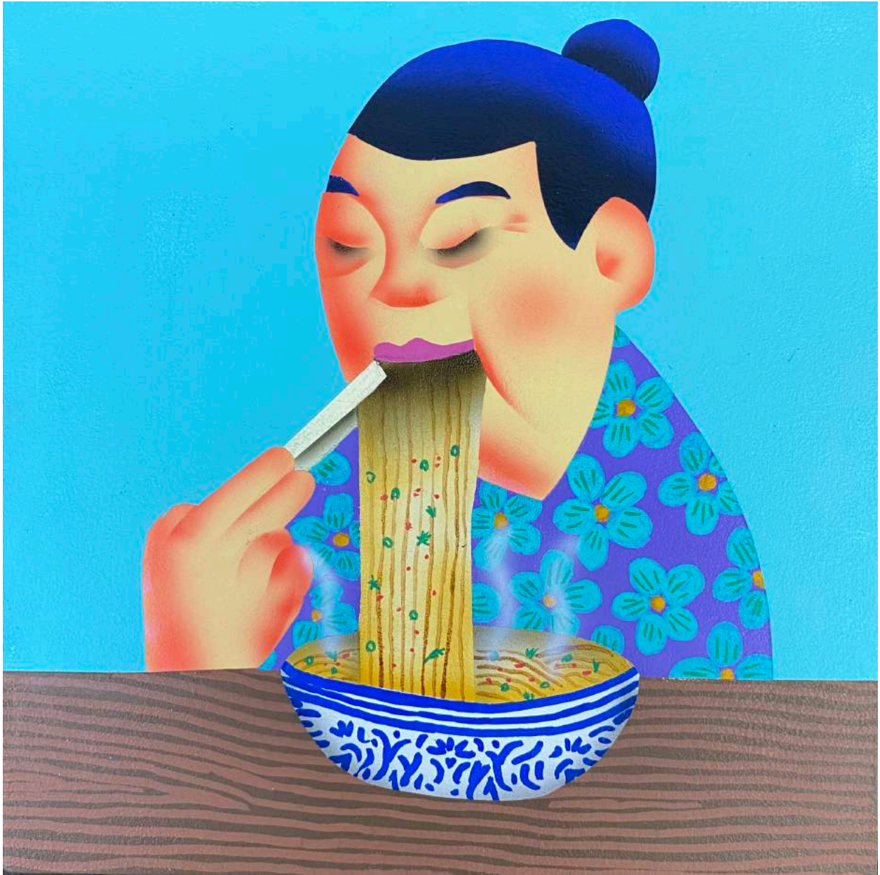
Fresh Pho (Blue)