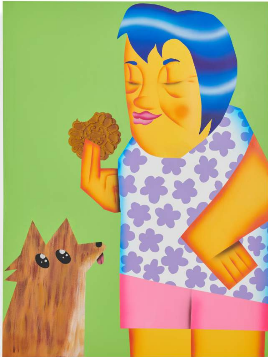
Downy ơi! (Bánh Trung Thu)