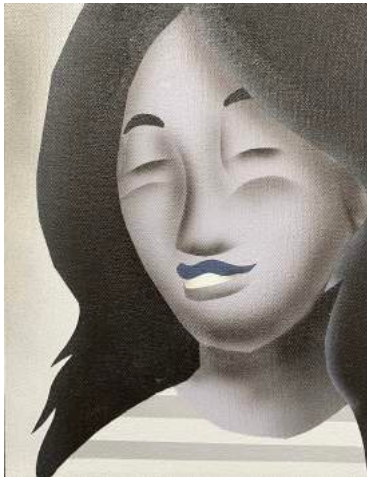
X-Mas Cheer (Mom F.O.B.)