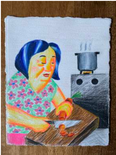
Chopping a carrot