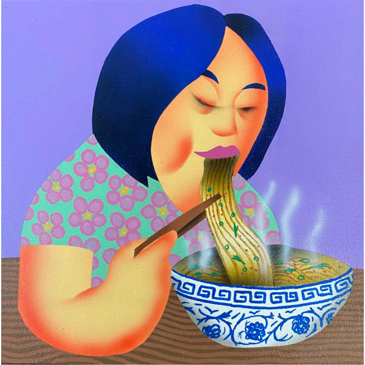
Fresh Pho (Purple)