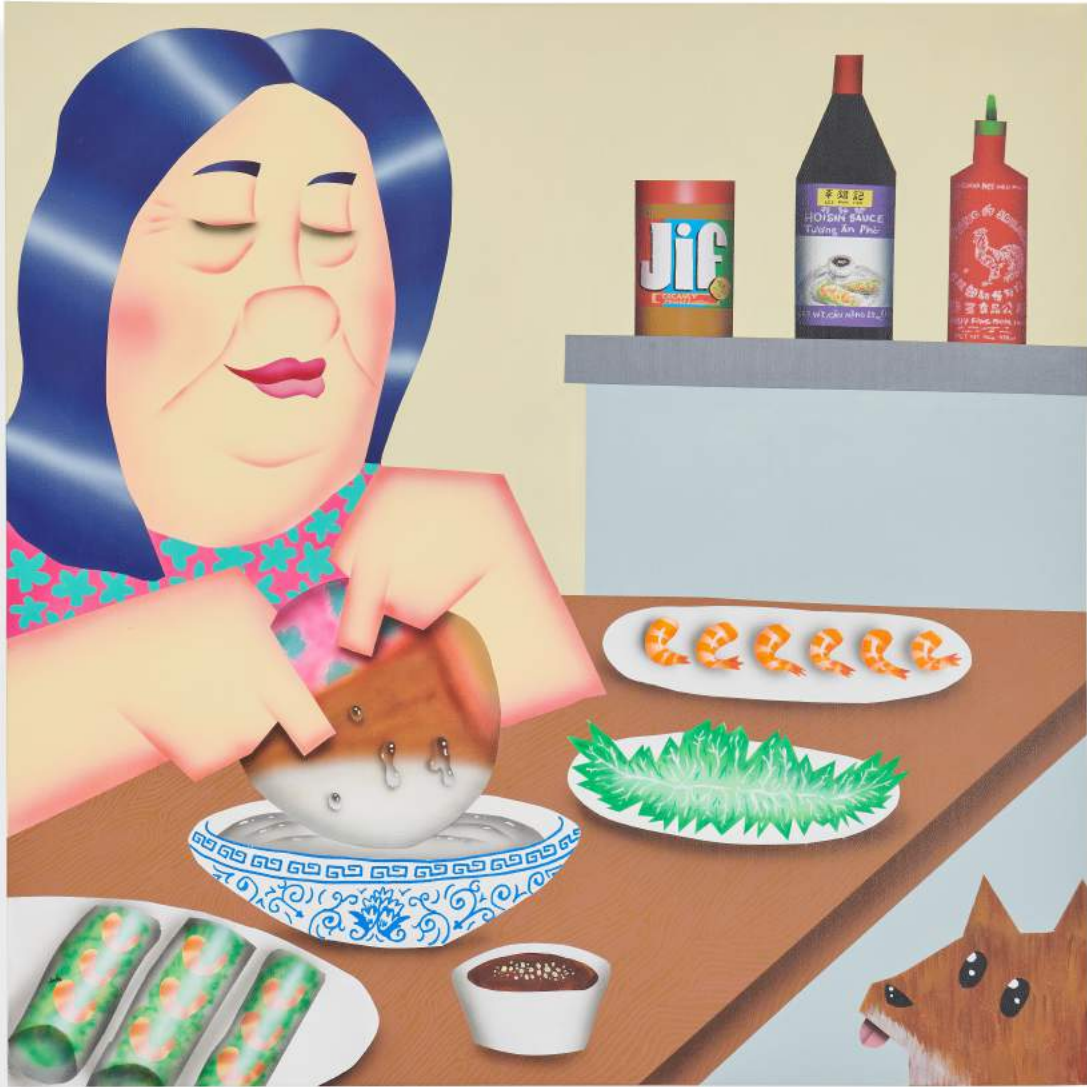
Gỏi cuốn (Making Spring Rolls)